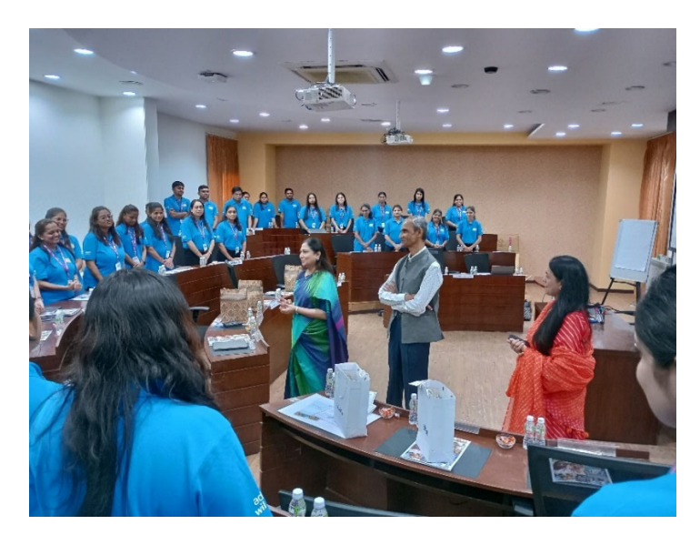
Figure 1: SuPoshan annual meet

SuPoshan Meet for training of SuPoshan Officers: A two-day SuPoshan meet was organized on September 22 & 23, 2023 to provide technical understanding to field level officers and promote cross-learning among teams across 14 sites. A technical session on WASH, IYCF, Counselling, using Web-application, nutrition was provided by subject specialists from within and outside the Adani Foundation. The two-day session not only boosted the knowledge of participants but also created a sense of common purpose as they interacted and learnt from each other.