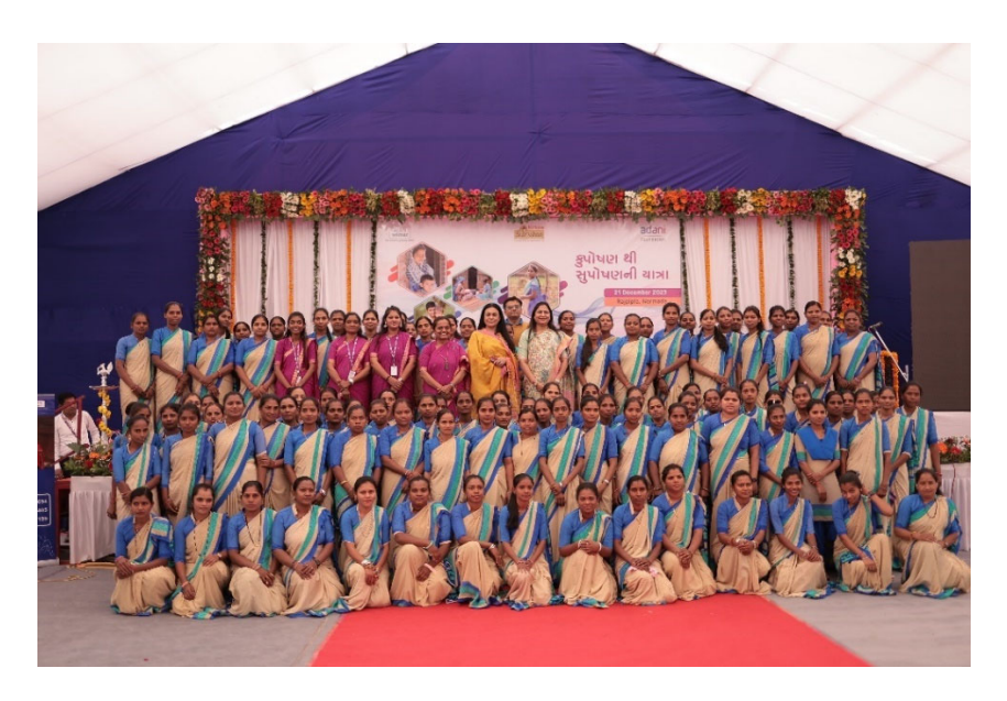
Figure 3: Visit of Chairperson at Narmada